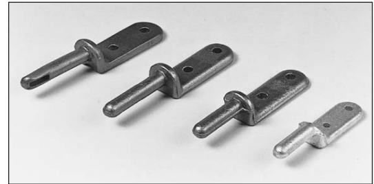
Left to right: 2605/001, 2604/001, 1016/001, 1042/002