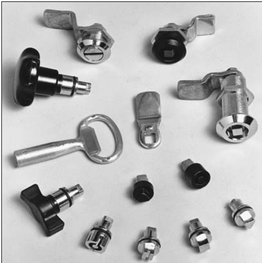
Brochure listing all available configurations and part numbers available on request.