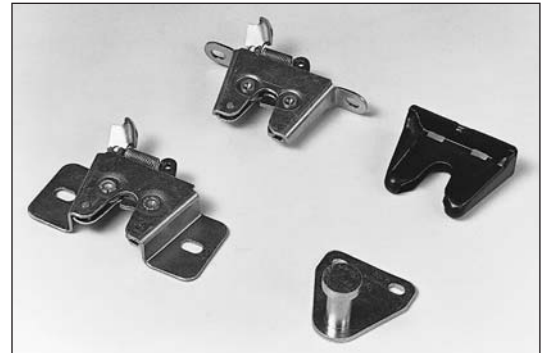
Left-0931/003 Top-0931/001 Right- 5589/223 Bottom- 0931/005