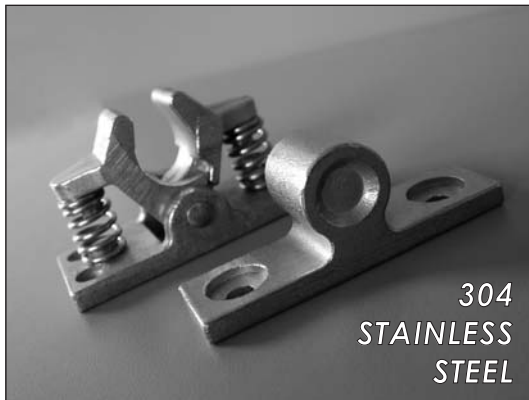
304 STAINLESS STEEL