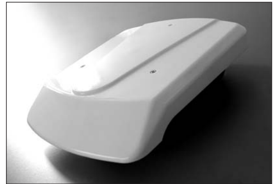
PACET ROOF VENTS Low Profile, Positive Ventilation