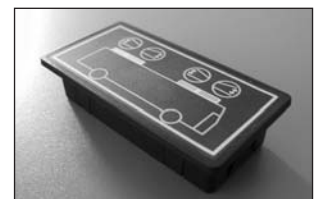
Inset shows control panel 9705/306000, for use with electric roof hatches.